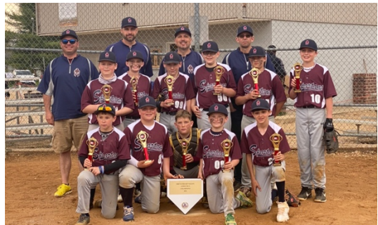
12U 1 st Place Finish at the “Spring Swing” Tournament April 17, 2021